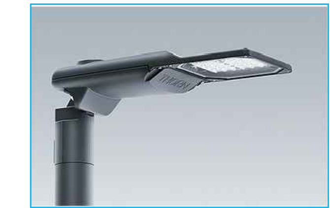
Thorn Isaro Pro